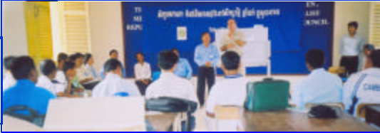
skasal atngTis esovePASKlaf...sukPaB enAvitua y RBHsbutS