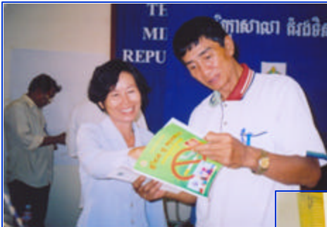
el ak KUKK Lak Bg Gnut KCK Gkar bergonesovePASKla f...sukPaB 3